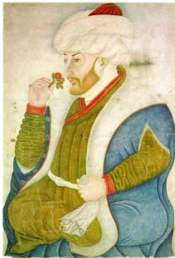
Sultan Mehmed the Conqueror painted in 1479 by Gentile Bellini

Teaching is not the only job historians can do. They can get into journalism or embark in a career of creative writing. They can become informed public relations agents, television broadcasters or simply stars. Knowledge of history can also lead to a political career, to the diplomatic service or to work in the public sector in such ministries, for example, as Tourism or Culture and Higher Education. There is also the possibility of employment in international organizations or in NGOs, in institutes of research or as archivists and professional librarians in the many universities of the region or abroad.