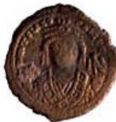
Money used in Roman, Crusader and Ottoman Beirut Bronze coins excavated by AUB students