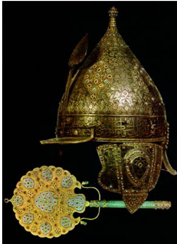
Inscribed Persian helmet

Historians and Archaeologists are detectives in academic disguise. They are involved in solving mysteries, not of the present but of the past, the ten thousand years or so that have made us what we are today. Historians find their clues in written documents of all kinds — biographies and memoirs, court records and articles in the press. Archaeologists survey the ground and excavate beneath the earth or go underwater searching for the objects and clues which provide evidence of how the human story began. Or they specialize in ancient languages deciphering and reading the texts of the past so we can understand them today.