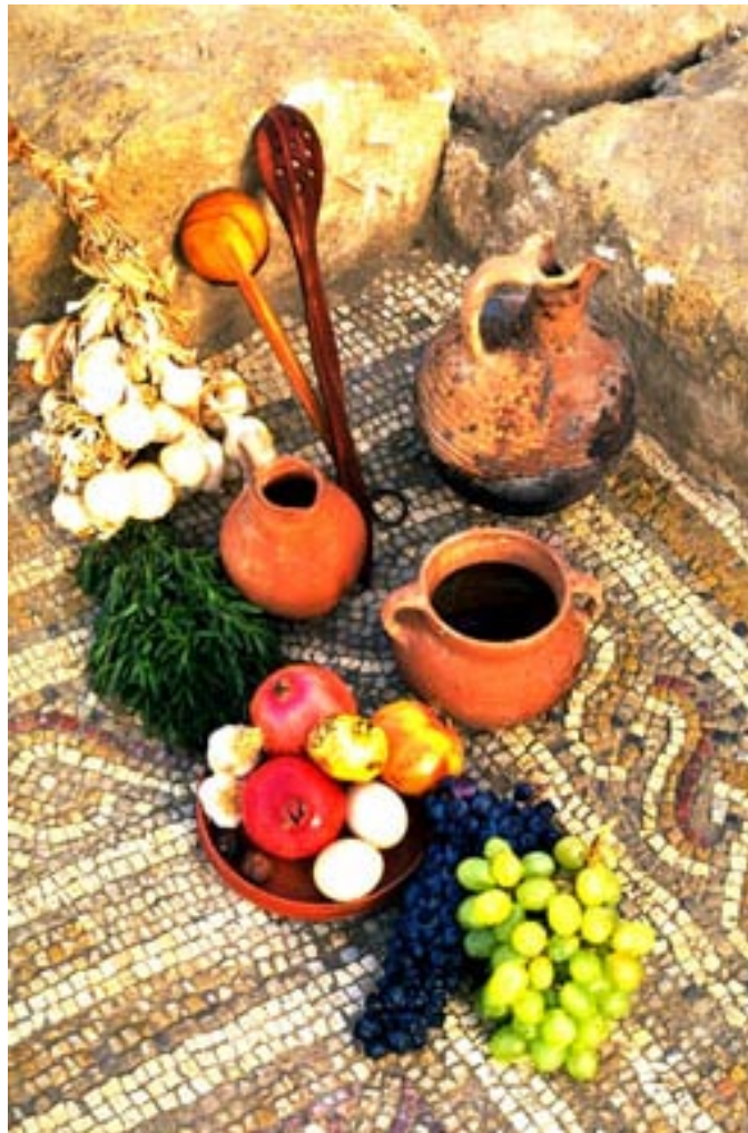
Roman pots excavated in Beirut and reconstructing domestic scene from archaeological samples from archaeological samples

Archaeologists excavate on land and underwater, thus retrieving the heritage of the past. They can specialize in heritage management, become museum curators and conservationists or knowledgeable tourist guides. Some can become art historians while others take up landscaping and urban planning to preserve architectural and other symbols of the past. Archaeologists can also become information technology (IT) experts and so write more complex recording systems, or create reconstructions and presentations of our common human past.