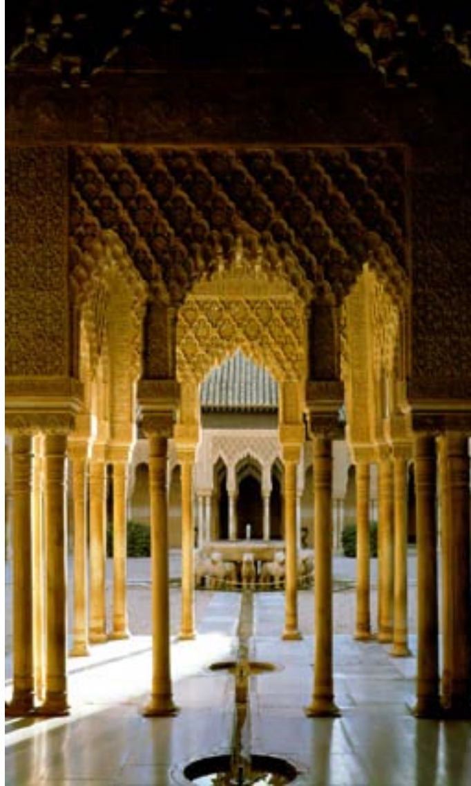
Alhambra of Granada: view into the Court of the Lions (14th cent.)

For further information: Department of History & Archaeology AMERICAN UNIVERSITY OF BEIRUT Bliss Street • POBox 11-0236 Beirut, Lebanon Phone (961) 1 350 000 - 341310 (961) 03 791 313 + ext. 4180 (Observatory) 4200 (Post Hall) email: Seikaly@aub.edu.lb • HSeeden@aub.edu.lb